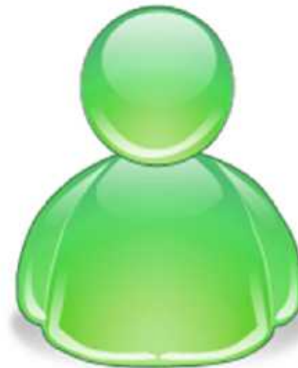
21 st Century Learner